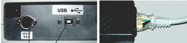
Power Port USB

The power supply and USB ports are in the back of the unit as shown below. Line up the pins of the power supply and plug it into the correct port, also be sure to plug the three prong cable all the way into the power supply. The USB cable will insert only when correctly oriented with a USB port, insert the cable into an open USB port on your computer.